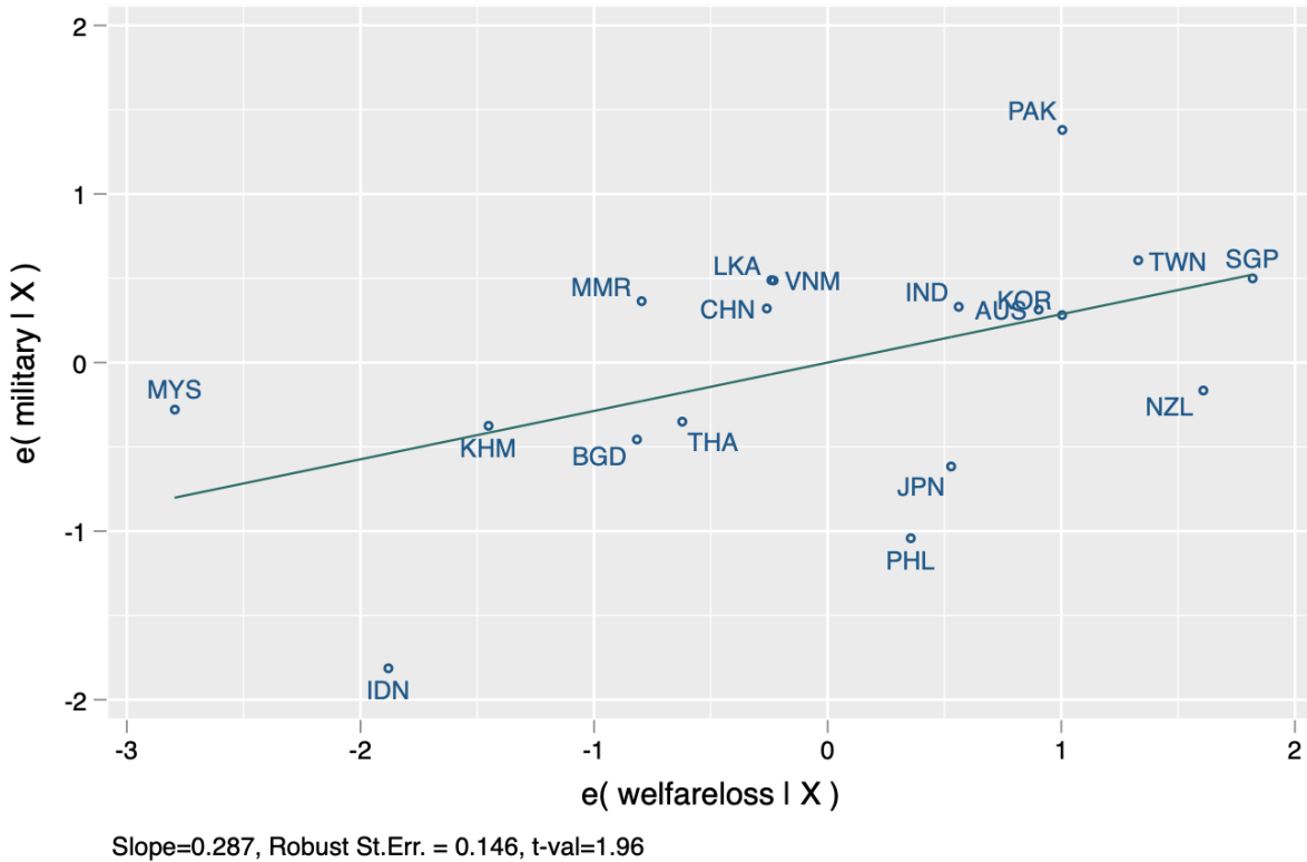
Figure 2: Conditional Correlation Between Military Spending and Welfare Losses

Notes: The slope, standard error and the fitted line in this added variable plot follow from the regression presented in column 1 of Table 3. Welfare loss in the x -axis is the expectation of model-implied counterfactual real GDP reduction conditional on the controls in the regression. The y -axis is expectation of 2001-2018 average military expenditure as a share of GDP conditional on the controls in the regression. Sample consists of countries in Table 2 except Hong Kong for which military expenditures are not separately reported. See text for further details and data sources.